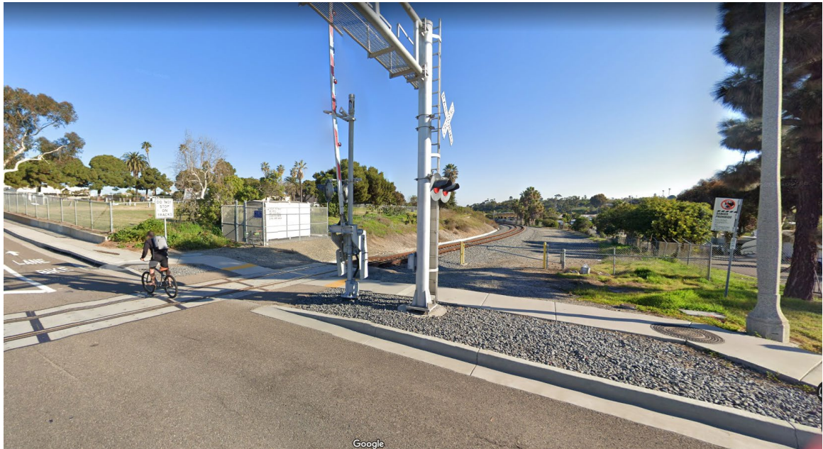
To reach the ocean, the Inland Rail Trail could potentially follow the Sprinter line or Loma Alta Creek